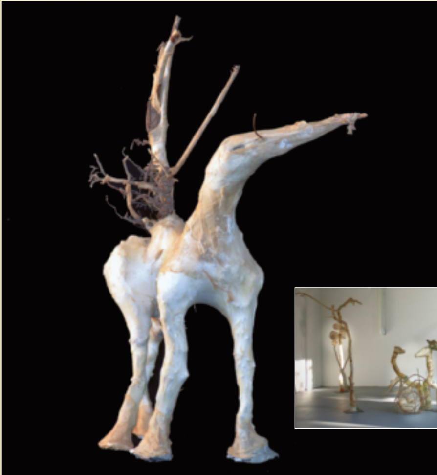
Horsebird , Handmade abaca paper, twigs, clay, wire, 8" x 12", 2013